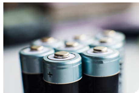
Figure 4. lithium batteries.

Lithium batteries were developed by American chemist, Gilbert N. Lewis (1875-1946) xxv , with non-rechargeable versions becoming commercially available in the early 1970s xxvi .