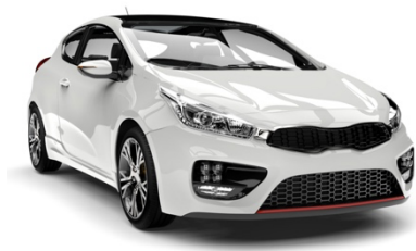
Figure 5. Tesla Electric Vehicles

In 2008, Tesla unveiled the Roadster, making it the first car company to commercialise a battery-powered electric vehicle vehicle.