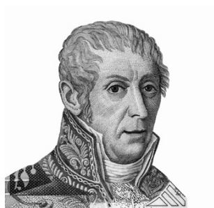
Figure 2. Alessandro Volta

It was Italian physicist, Alessandro Volta (1745-1827) xii , however, who is credited with inventing the modern battery.